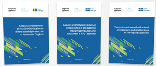
Image: The Report is available in English, Romanian and Russian Languages

The report can be found and downloaded on https://gagauziadialogue.md/the-report-analysis-of-arrangements-and-institutional-relations-between-central-authorities-and-gagauz-autonomy/ . To introduce an overall presentation of Gagauzia and its institutional settings, a short video was developed. The video can be watched on the Youtube channel - "Gagauzia Dialogue".